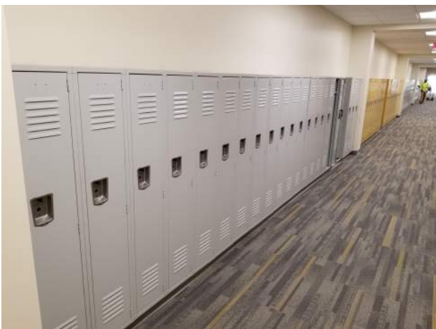
Area G 2nd Floor Lockers