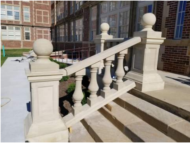
Courtyard Stone Railings